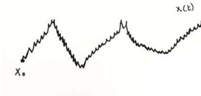
FIGURE 2.2: A SAMPLE PATH FOR A SOLUTION OF A STOCHASTIC DIFFERENTIAL EQUATION

Below is a graph of trajectory of the stochastic differential equation.